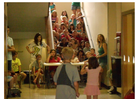
Tipp City definitely has talent!