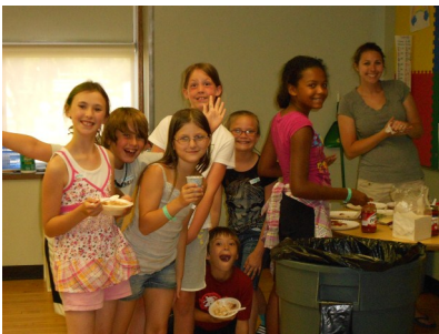
Welcome to the TCEP Pizzeria!