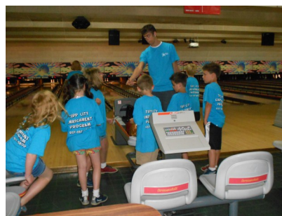
Ready, Set, Bowl!