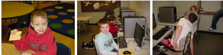
Before & After School is always loads of fun!