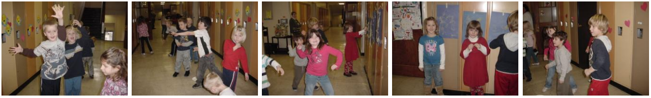
Spaghetti Art is always great fun!