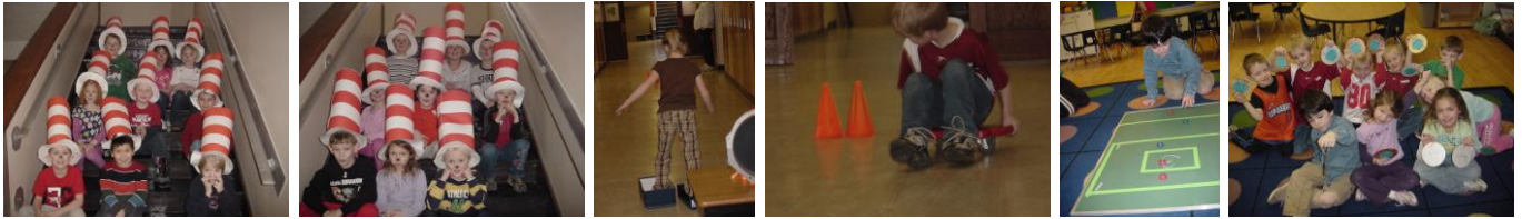
What fun to celebrate Dr. Seuss's B-Day and also participate in the K-Enrichment Olympics!